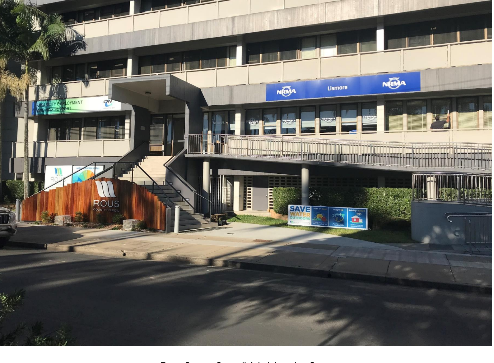
Rous County Council Administration Centre 218-232 Molesworth Street, Lismore