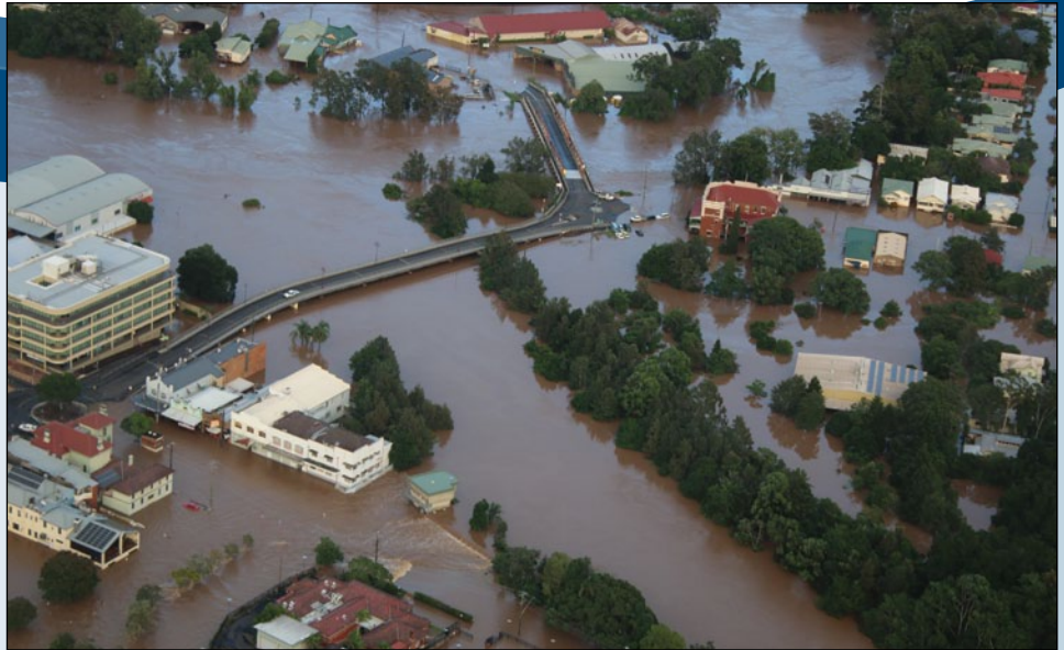
Floodwater flows out of the Wilson River and over the levee wall at the pump station (bottom, centre) on Molesworth Street, Lismore.