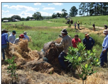
Field day participants pitch in.

The first booklet also includes sections on biodiversity in the Lismore region, a history of settlement and