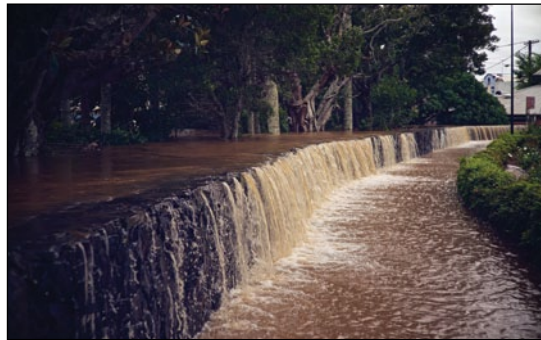
At Spinks Park, Lismore, the levee overflows in a controlled manner which minimises flood damage.

Without the levee, city streets such as Keen Street would have been flooded by midnight on March 30.