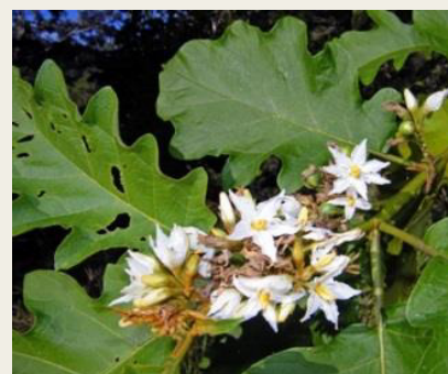
Giant devil's fig ( Solanum chrysotrichum )