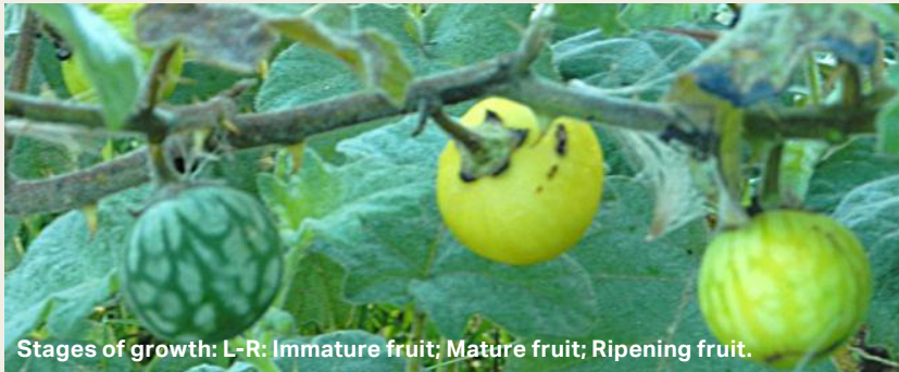
Stages of growth: L-R: Immature fruit; Mature fruit; Ripening fruit.

These weeds are present in limited distribution and abundance in some parts of the State. Elimination of the biosecurity risk posed by these weeds is a reasonably practical objective.